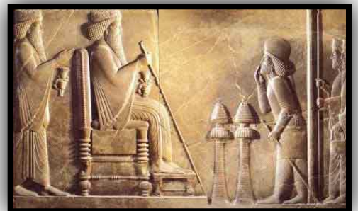
Stone carving of Darius I. Behind him is his son, Xerxes. Found in the Apadana building in Persepolis

The next 150 years of Persian history saw slow decline under a series of ineffective rulers. Rebellions multiplied. By 359 BCE, Phillip II of Macedonia had seen the empire's weakness and planned an invasion. He was murdered before he could launch the plan, but his son Alexander carried it forward. In 330 BCE, Alexander earned his title “the Great” with the defeat of Darius III the last emperor of the Achaemenid dynasty.